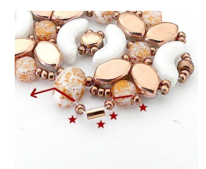
23) Pick up 1 R15, pass through 2nd hole of Kalos, pick up 1 R15, 1 Bugle, 1 R15, pass through Samos