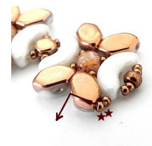
15) Pick up 2 R15, pass through Paros