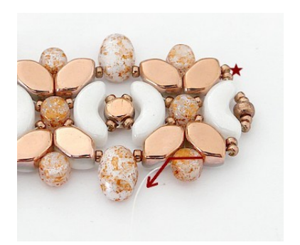
19) Pick up 2 R15, pass through Arcos-2R15-R8-2R15-Paros-Kalos