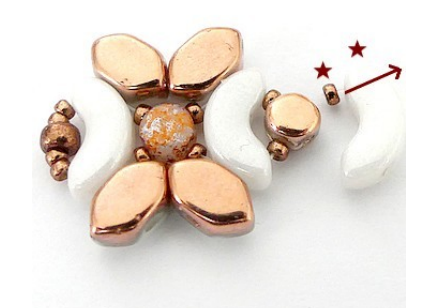
8) Pick up 1 R15, 1 Arcos