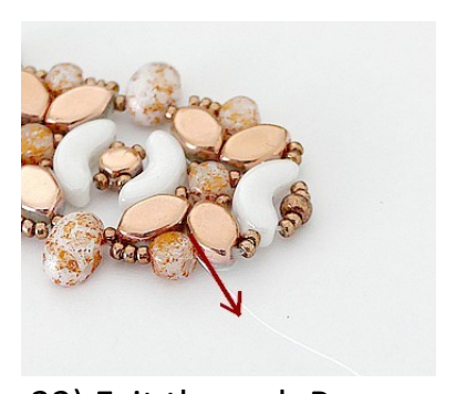
22) Exit through Paros