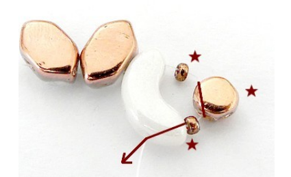
2) Pick up 1 R15, 1 Kalos, 1 R15, pass through 2nd hole of Arcos