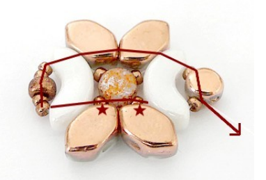
6) Pick up 1 R15, pass through Kalos, pick up 1 R15 and pass through all beads like picture to exit through 1st hole of Kalos