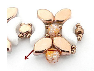
16) Pick up 1 Kalos, pass through following Paros