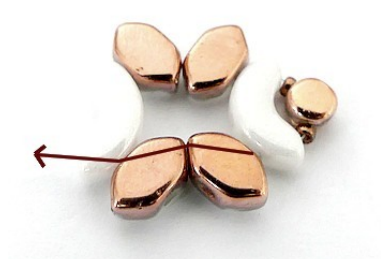
3) Pick up 2 Paros like picture, 1 Arcos