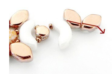
9) Pick up 2 Paros like picture