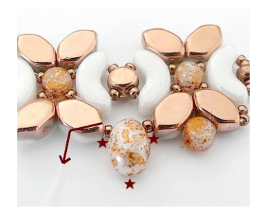
17) Pick up 1 R15, 1 Samos, 1 R15, pass through following Paros. Repeat steps 16 and 17 for the length of the pattern