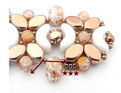
20) Pick up 3 R15, pass through R15 - Samos - R15