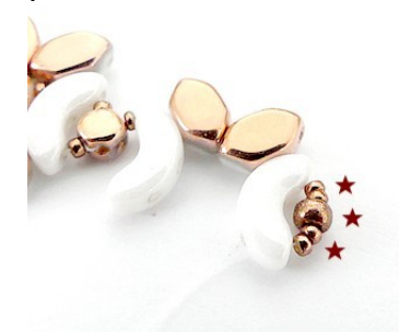
12) You must end with step 4