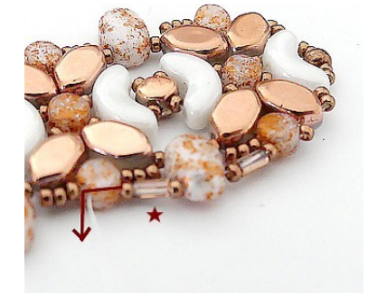
24) Pick up 1 R15, 1 Bugle, 1 R15, pass through Kalos. Repeat steps 23 and 24 for the length of the pattern