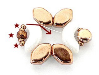
4) Pick up 2 R15, 1 R8, 2 R15, pass through 2nd hole of Arcos