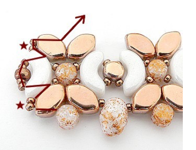
18) At the end of the bracelet, pick up 2 R15, pass through Arcosseedbeads-arcos, pick up 2R15, pass through following Paros. Repeat steps 16 and 17 for the length of the pattern