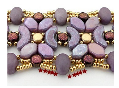
26) You can replace 2 R15 and bugles by 5 R15 for another version!