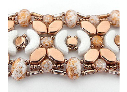
25) You'll now have this, you can close your work