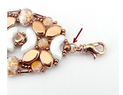
27) Place rings and clasp to finish your bracelet!