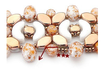
21) Pick up 3 R15 pass through Kalos and repeat steps 20 and 21 for the length of the pattern