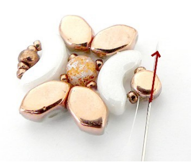
7) Pass through 2nd hole of Kalos