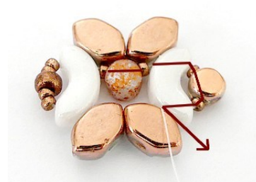
5) Pick up 1 R15, 1 Kalos, 1 R15, pass through 1 hole of 1st Arcos-R15-Kalos-R15-2nd hole of 1st Arcos